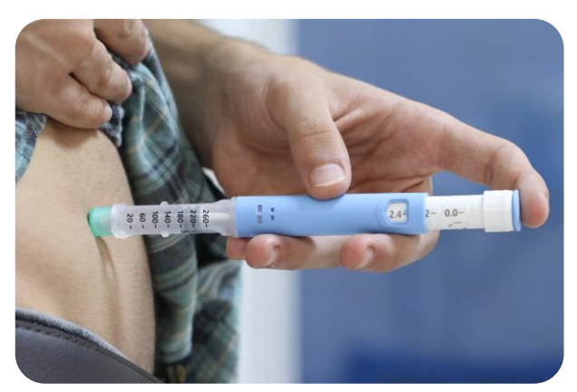
Designed with the patient in mind for comfort & ease of use.

We produce our products in a world-class, ISO 13485-certified manufacturing environment